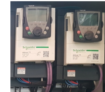
11 / Trolley Frequency inverter