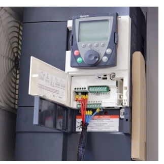
13 / Crane Frequency inverter