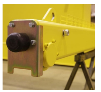
7 / End trucks with plates