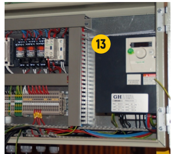
10 / Crane control panel