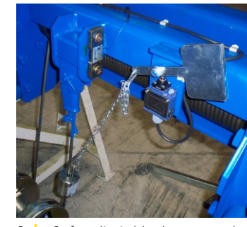
9 / Safety limit block operated