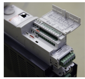
12 / Hoist Frequency inverter